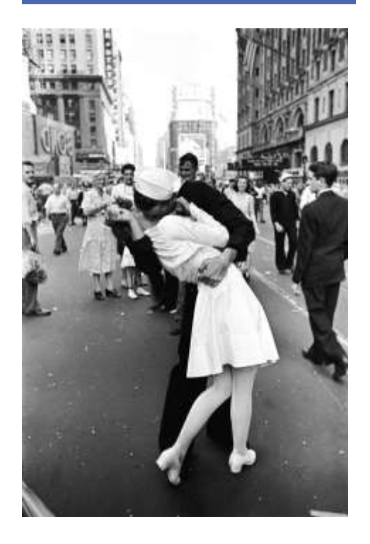
Times Square Kiss - Alfred Eisenstaedt